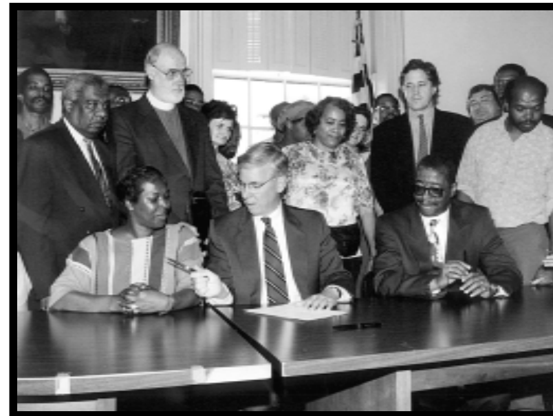
Maryland Governor Parris Glendening (seated center) signs Baltimore’s living wage bill into law as BUILD members look on.

Angeles, LAANE and allied groups, after passing two living wage laws in LA County, were instrumental in securing living wage levels for over 5,000 employees of a new entertainment development, most of whom will join labor unions. Even the McDonald’s facilities in the complex must pay a living wage and provide health benefits to their workers. These dramatic gains are the direct results of years of community organizing and alliance building that began with a living wage campaign.